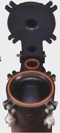
Halar® Lined Housings and Accessories