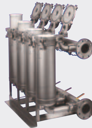
Valved, Parallel and Staged/Series Filter Systems