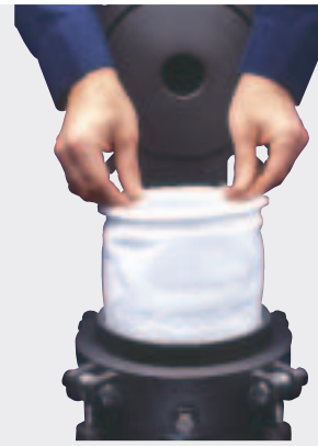
Accufit® Welded Liquid Filter Bags

Division of Mechanical Mfg. Corporation 10304 N.W. 50th Street • Sunrise, FL 33351 USA Tel: 954-572-2700 • Fax: 954-572-3401 www.filtrationsystems.com