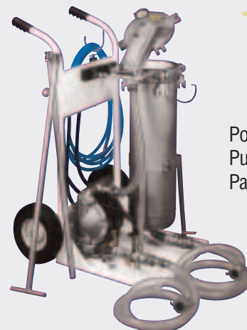
Portable Liquid Pump and Filter Packages